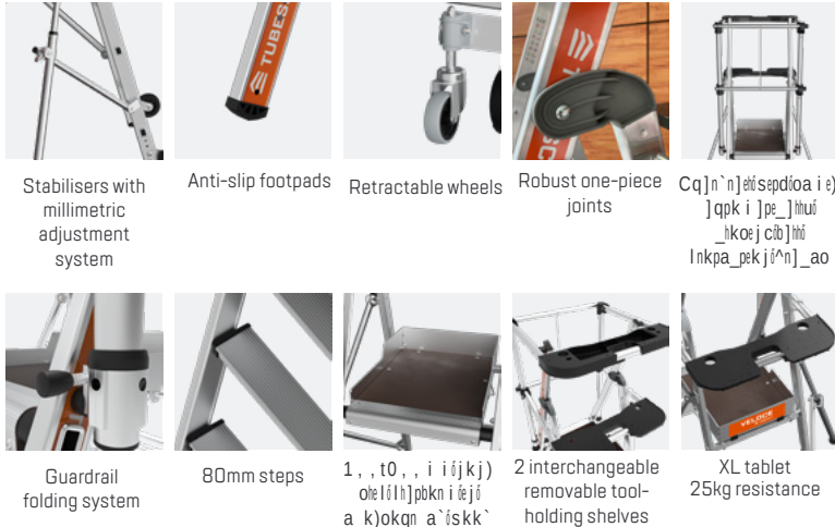
Stabilisers with millimetric adjustment system

**Tested and certified by RISE up to 6 steps.