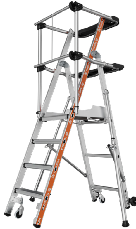
Veloce Braces 4 steps